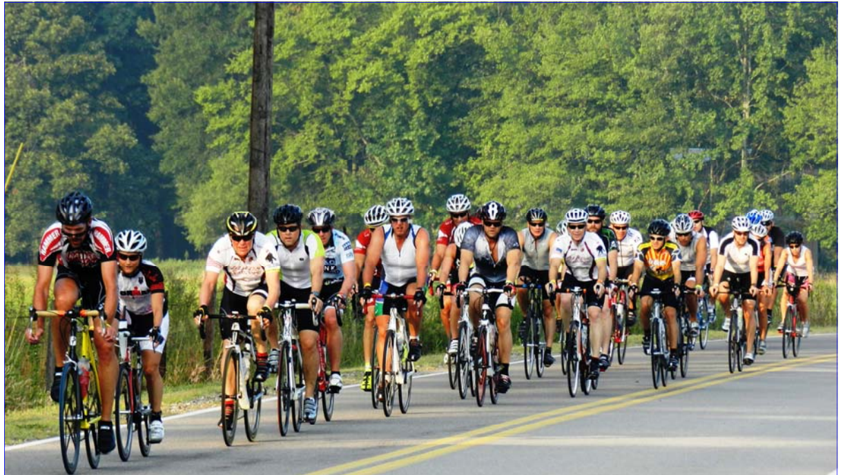
The Peloton approaching the Webb Road rest-stop, 2011 Sunrise Century Bike Ride

One of the most enjoyable events of the past two years for APSURANS has been helping to staff rest stops along the 100-mile route of the Sunrise Century Bike Ride, sponsored by the Clarksville Sunrise Rotary Club. Watching over a thousand bikers in their colorful gear materialize silently out of the morning mist along the country roads north of town is an amazing experience. Some of them go whizzing by as they try to set new speed records on the 100-mile loop, while many others stop to visit with us