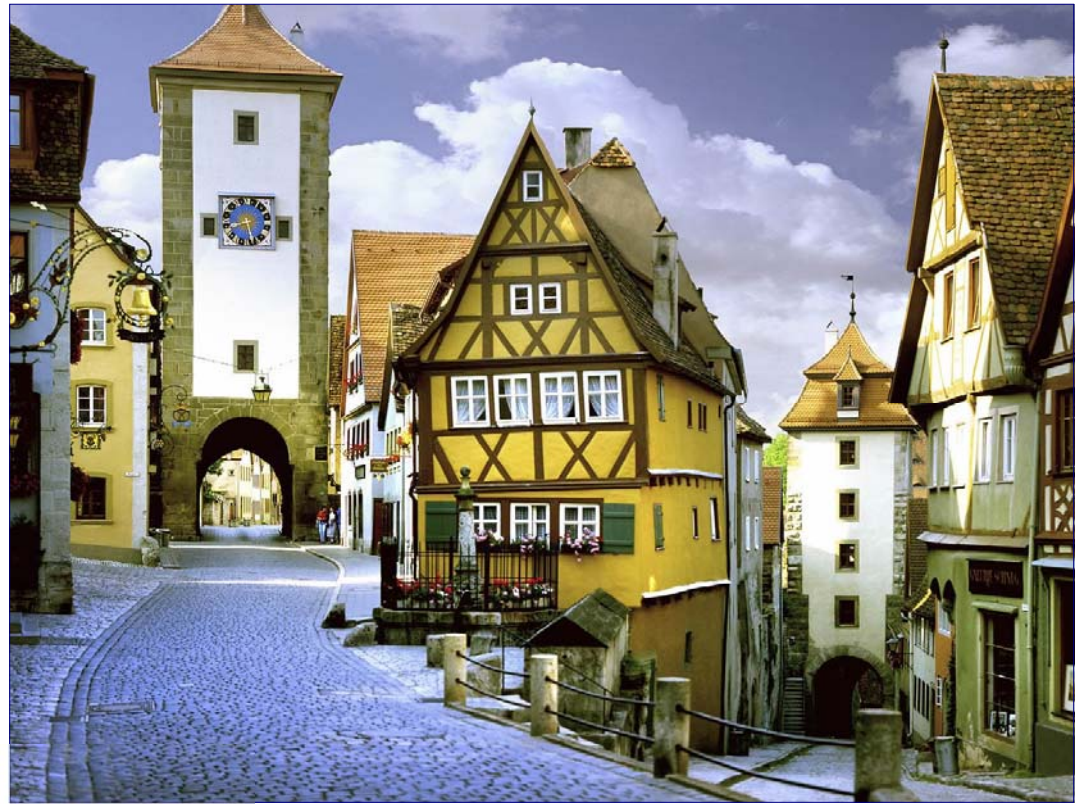
Photo: Rothenburg, a stop on the Alumni Asso- ciation tour of wines of Germany and France.