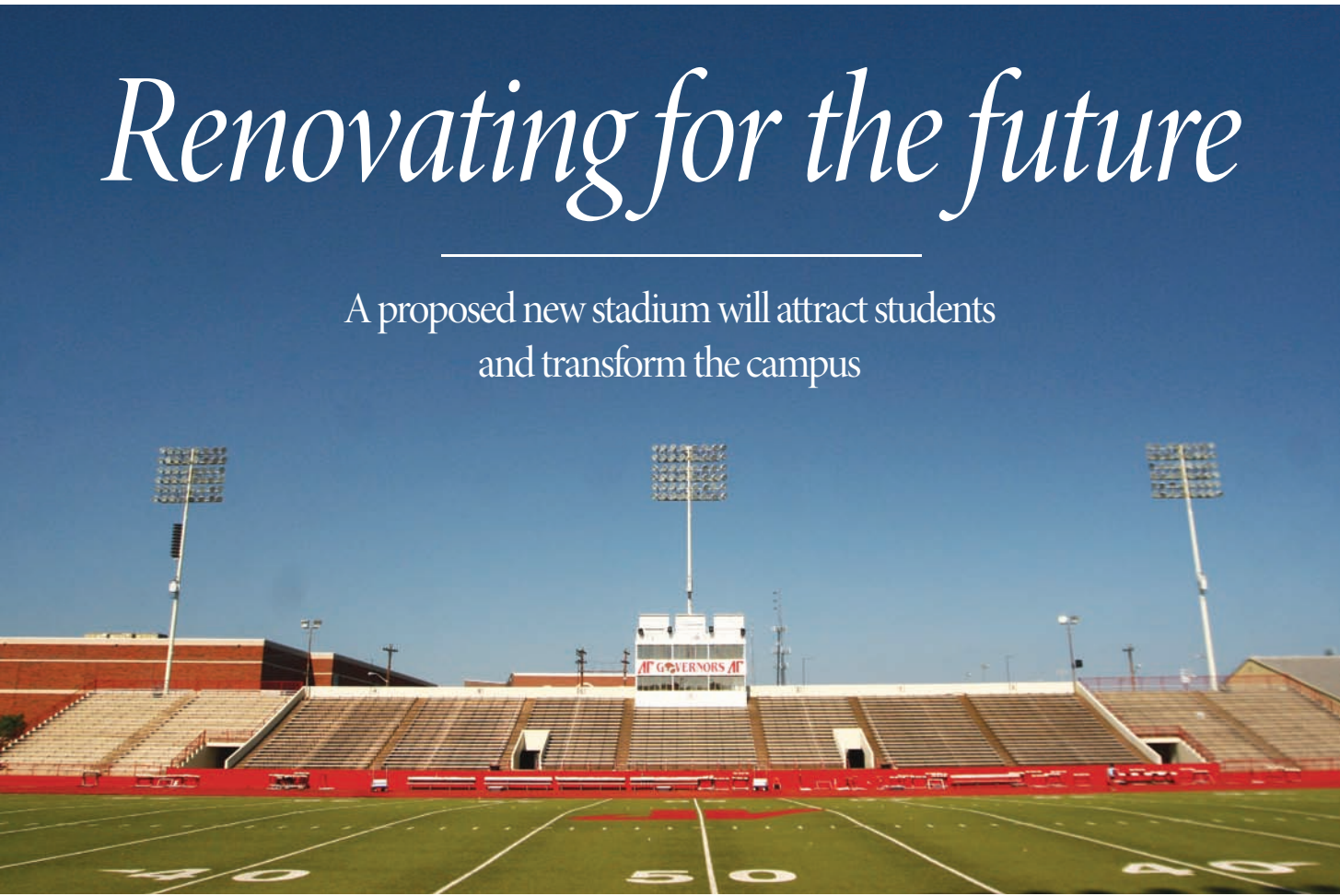
The home side of Governor's Stadium is proposed to be demolished and rebuilt during the 2013-14 academic year. Governor's Stadium is showing signs of it's age as the university searches for a new sponsor.

» By AARON FORSGREN aforsgren@my.apsu.edu