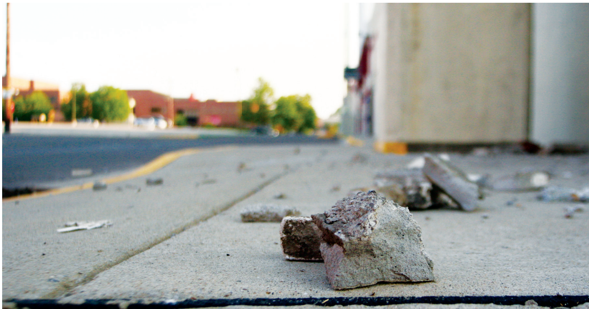
Governors Stadium was originally constructed in 1946 as Municipal Stadium. Despite upkeep and renovations over the last 65 years, the 10,000 seat multi-purpose stadium has fallen into disrepair. APSU now plans to renovate Governors Stadium to increase recruitment opportunities.