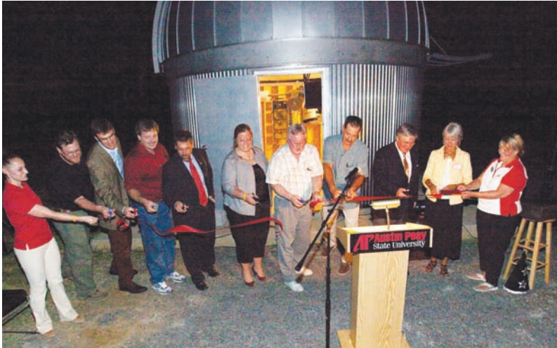
Ribbon cutting at the grand opening of the new observatory at the APSU Agricultural farm. PUBLIC RELATIONS AND MARKETING

The new observatory will give students studying both astronomy and physics a place to view the universe