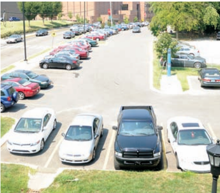
The new Math and Computer Science building will be located across from Sundquist Science building.