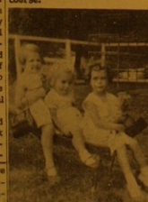
At the nursery school...

Circle K Club members were parade marshals for the Clarksville Christmas Parade November 27, which included the college band and Governesses.