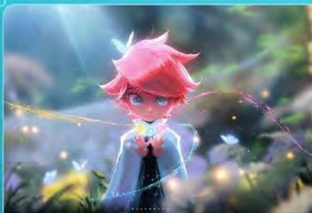
FAYE'S ORIGIN STORY