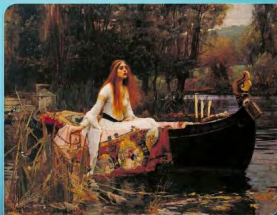
THE LADY OF SHALOTT