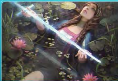
LADY OF THE LAKE 1