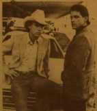
THE STARS—Michael Beck ("SGT Levon Lundy") and Michael Pare ("SGT Joey La Fiamma").

Lundy doesn't know what to think about his new partner, who wears sharp duds, carries two Italian pistols, abhors country music and Texas chili and drives around in souped-up sports car. Lundy fits the Texas-stereotype perfectly with his shiny .357 Magnum sidearm and his blue jeans and cowboy boots. He lives in a big ranch house, where he parks his pick-up truck.