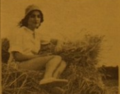
Everybody enjoys farm work in Europe