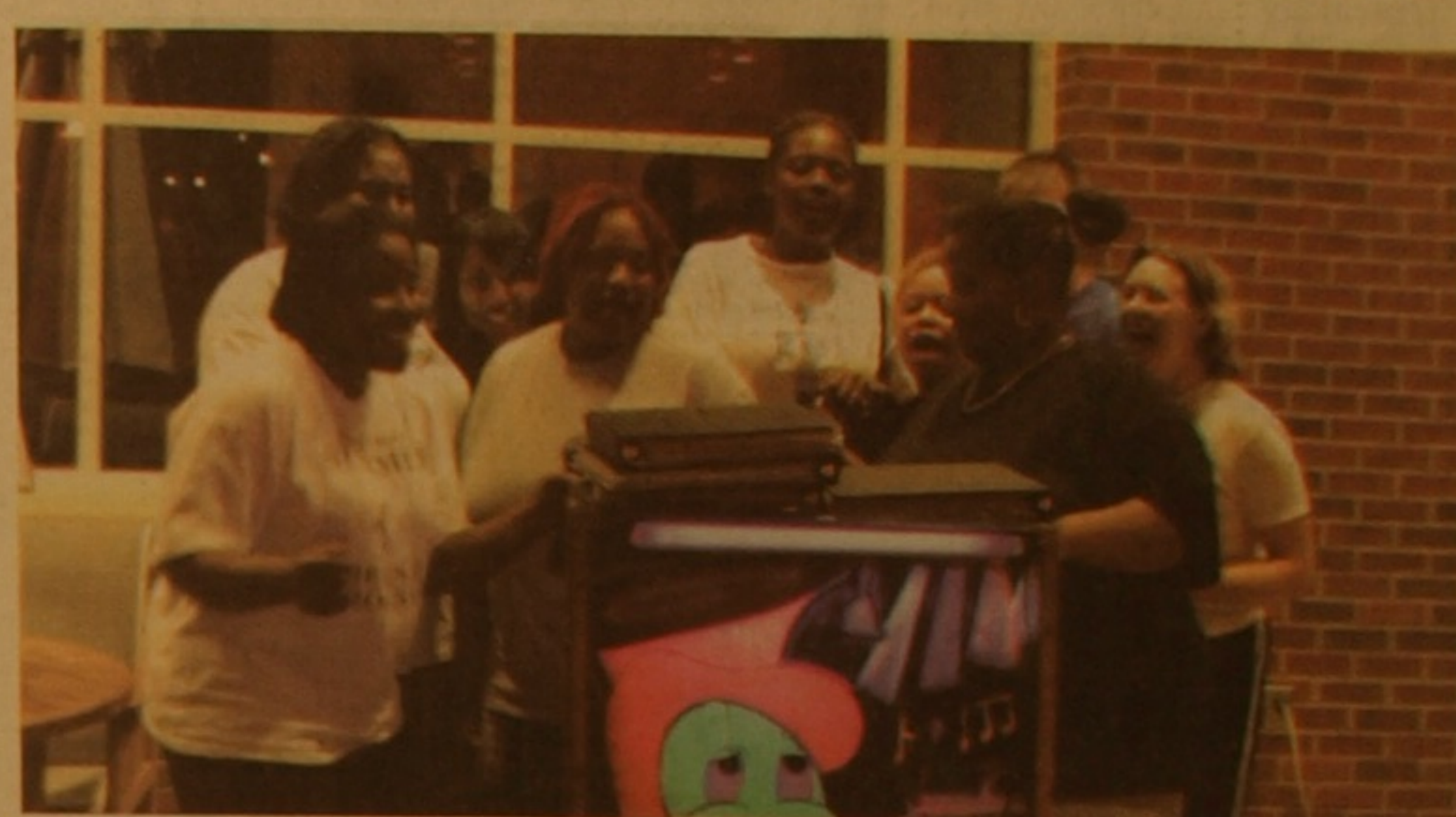
APSU Students "get the party started" singing Pink's hit song Thursay evening at Karaoke.

Along with many "Make Your Peay Connection" speakers there has also been a trip to Wal-Mart and tour of Clarksville planned for those new to the area or without transportation.