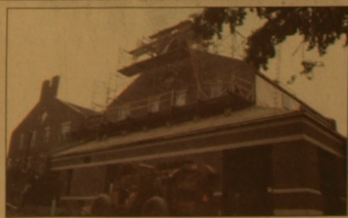
Construction started on Beatrice Hand Village in the earlier part of 2002. Out of the eight buildings three have opened, leaving two already booked unfinished along with a lobby and two additional buildings. The unfinished buildings are scheduled to be finished toward the end of August or first of September.