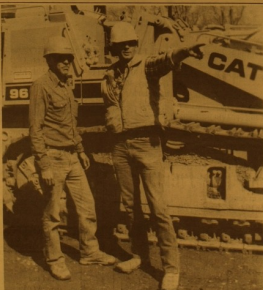
GETTING ON THE MOVE—Construction workers discuss the developments of the site for the new mass communications/music building at APSU.

April 21-25 will find the Forensics Team competing for the National Forensics Association individual events national collegiate title in Tempe, Arizona.