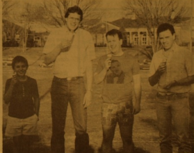
THANK YOU MR. ICE CREAM MAN—Members of the All State staff enjoy frozen treats.