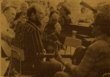
It's a hoe-down! Fiddlers and pickers jammed at last weekend's Tennessee Old-Time Fiddlers Championship at Clarksville High School.