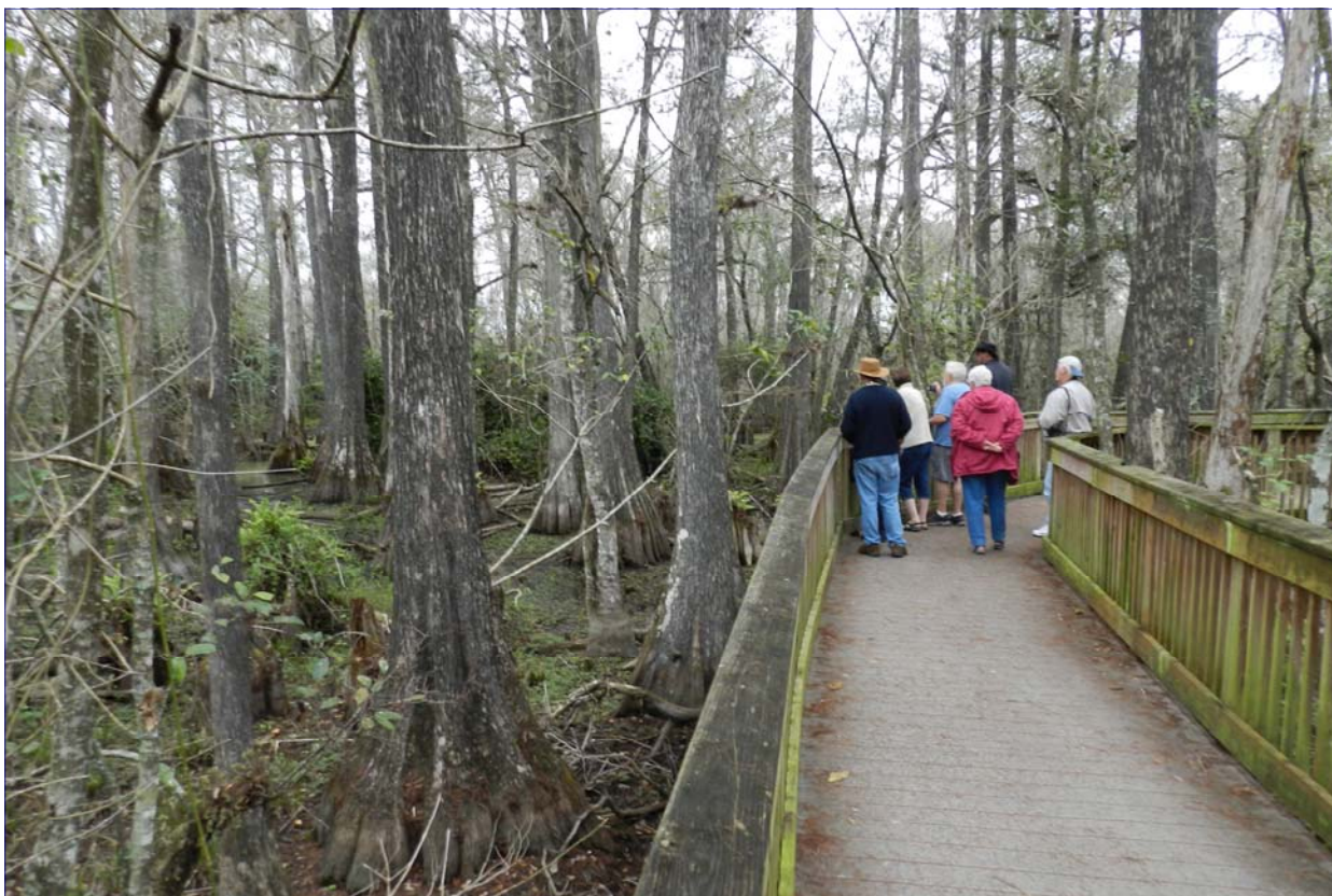
Safari into the Big Cypress National Preserve, Ochopee, Florida, Jan. 4, 2014

Increasing numbers of Americans are discovering that an economical and usually easy way to escape the winter weather for a while is to take a Caribbean cruise. Luckily, mechanical disruptions and outbreaks of norovirus on board are relatively rare. Our dollars also contribute a bit to the well-being of the tourism-dependent islands we visit, and the Filipino crew. Ships sail every weekend from Ft. Lauderdale, Miami, Tampa, and other cities, and rates are highly competitive and reasonable for a week in the sun. Several airlines offer direct flights, which eliminate harrowing plane-changes in Atlanta.